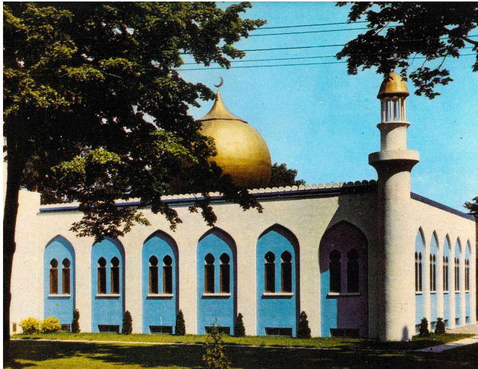
London Muslim Mosque, 1964