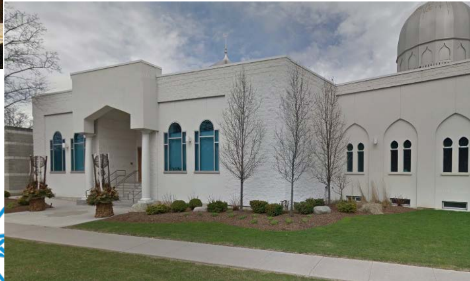
London Muslim Mosque, today